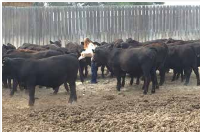
Baylie's supplemental feed program consisted of feeding the bulls sweet corn husks