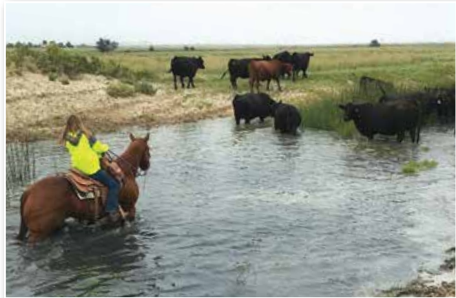
Baylie helping bring the fall cows home to calve