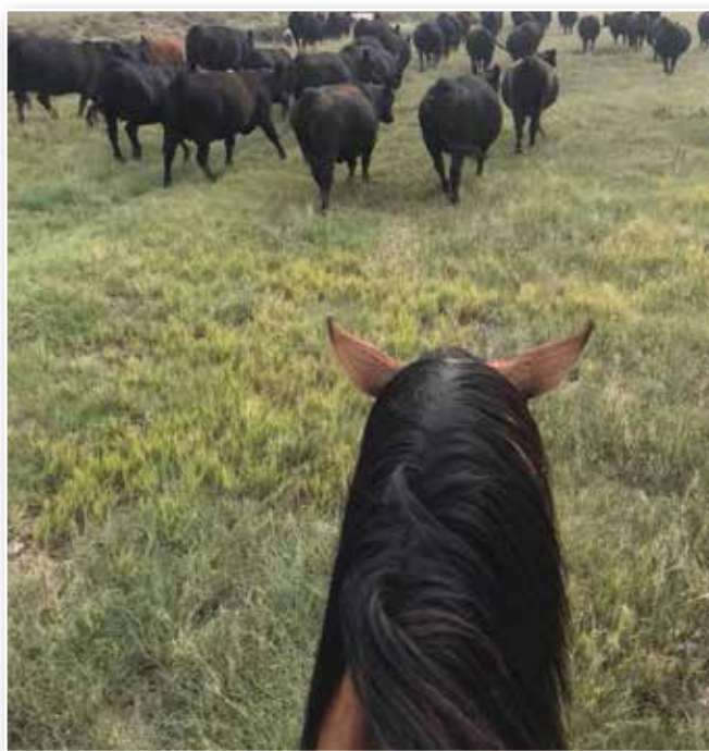
Bringing the cows home from pasture to calve