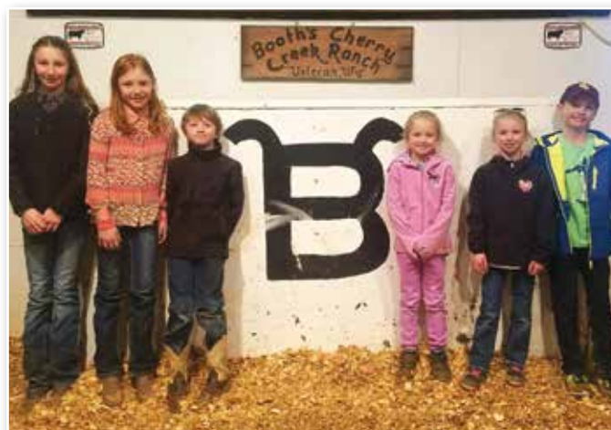
Booth Grandkids at the 2018 Bull Sale