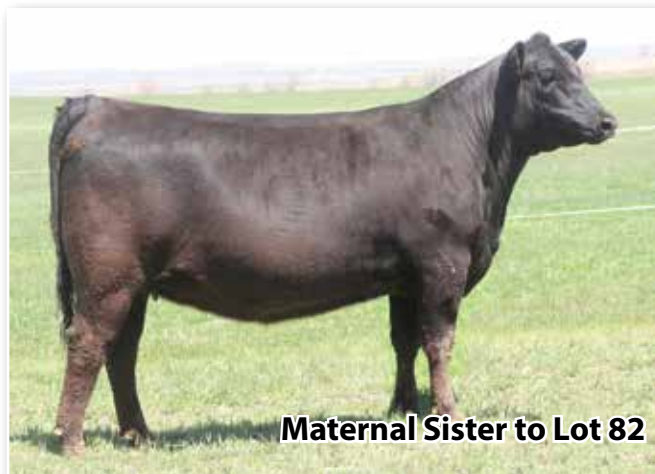
Maternal Sister to Lot 82