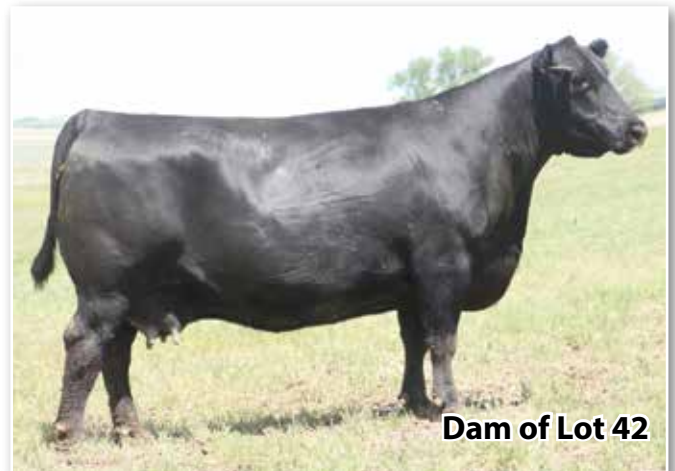
Dam of Lot 42