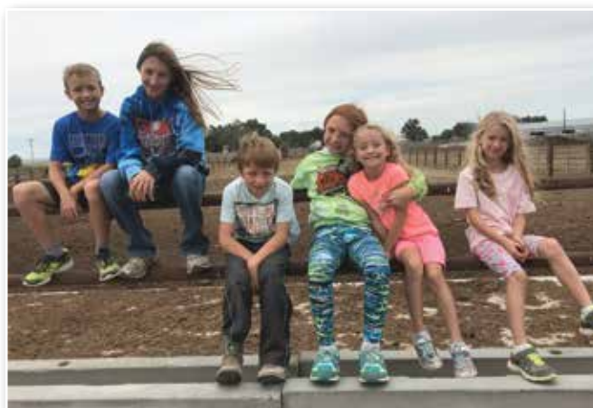
Cousins enjoying a day of work together