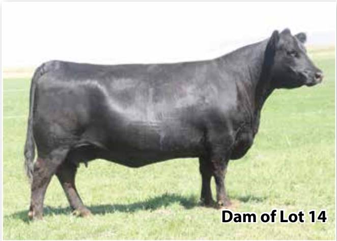
Dam of Lot 14