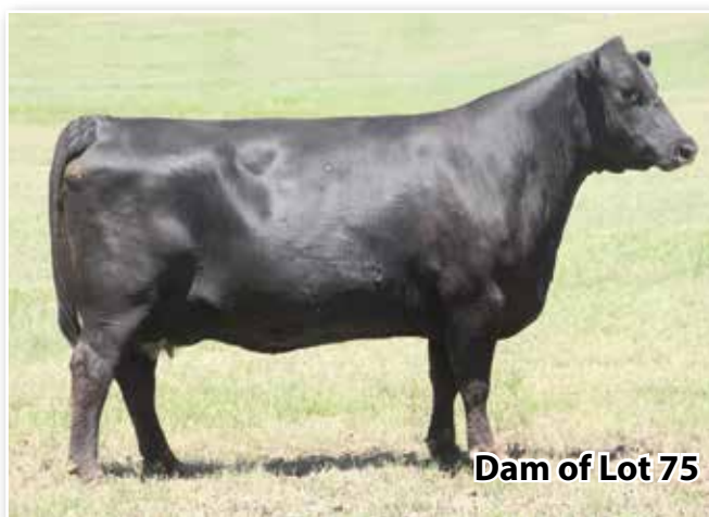
Dam of Lot 75