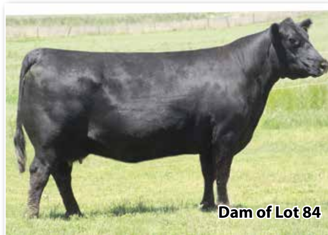
Dam of Lot 84