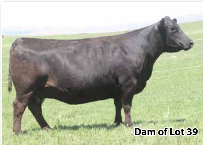
Dam of Lot 39