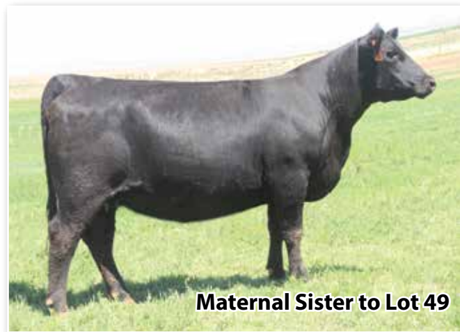
Maternal Sister to Lot 49