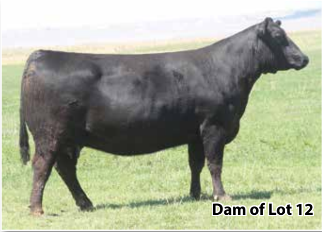
Dam of Lot 12