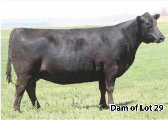
Dam of Lot 29