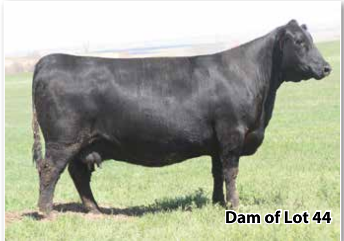
Dam of Lot 44