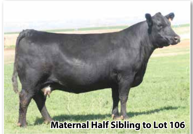
Maternal Half Sibling to Lot 106