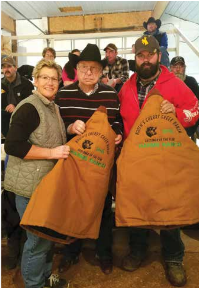
Harms Ranch, Pine Bluffs, WY