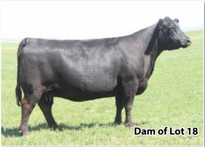
Dam of Lot 18